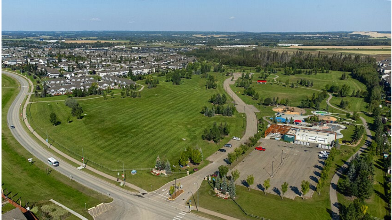
1. Jubilee Park, Spruce Grove, AB.