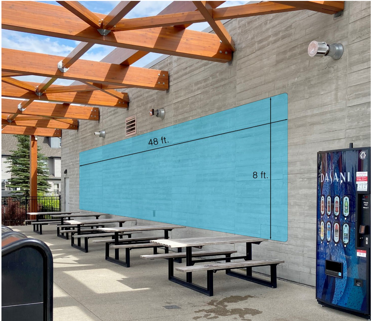
4. Area for Mural