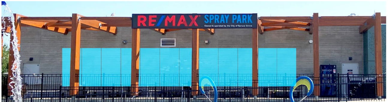
2. Simulated panels on REMAX Spray Park Wall