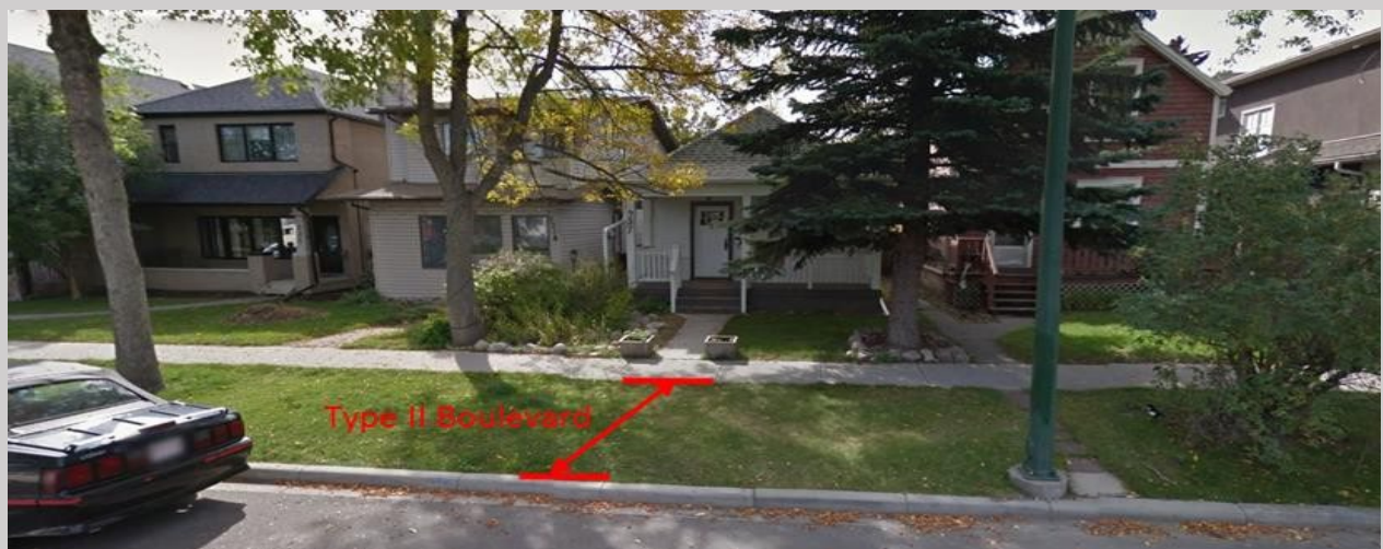
Type II boulevard showing potential boulevard garden space between public sidewalk and curb of road.