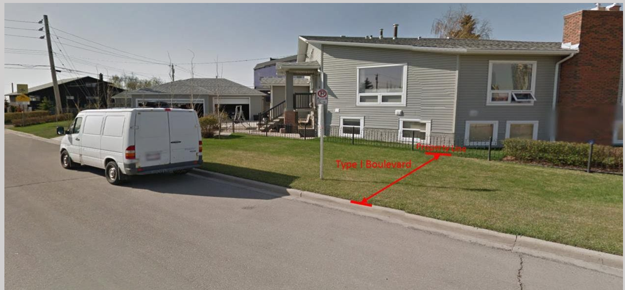
Type I boulevard showing potential boulevard garden space between private property line and curb of road.