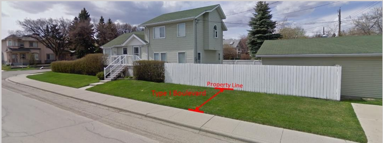
Type I boulevard showing potential boulevard garden space between private property line and sidewalk.